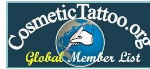
AUSTRALIAN COSMETIC TATTOO